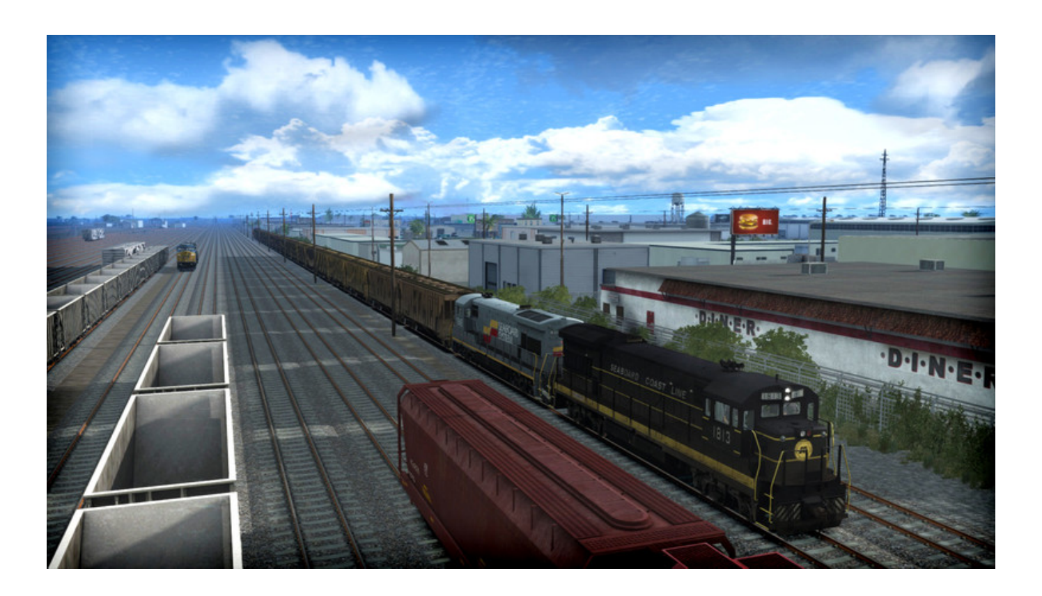
Download ->>> http://bit.lv/2SNohdI

Train Simulator: SeaboandScifulaBotB Scotoo Add Gent BotBeho Doo Add both Scoto Nutboo Vento ad [serial Number]